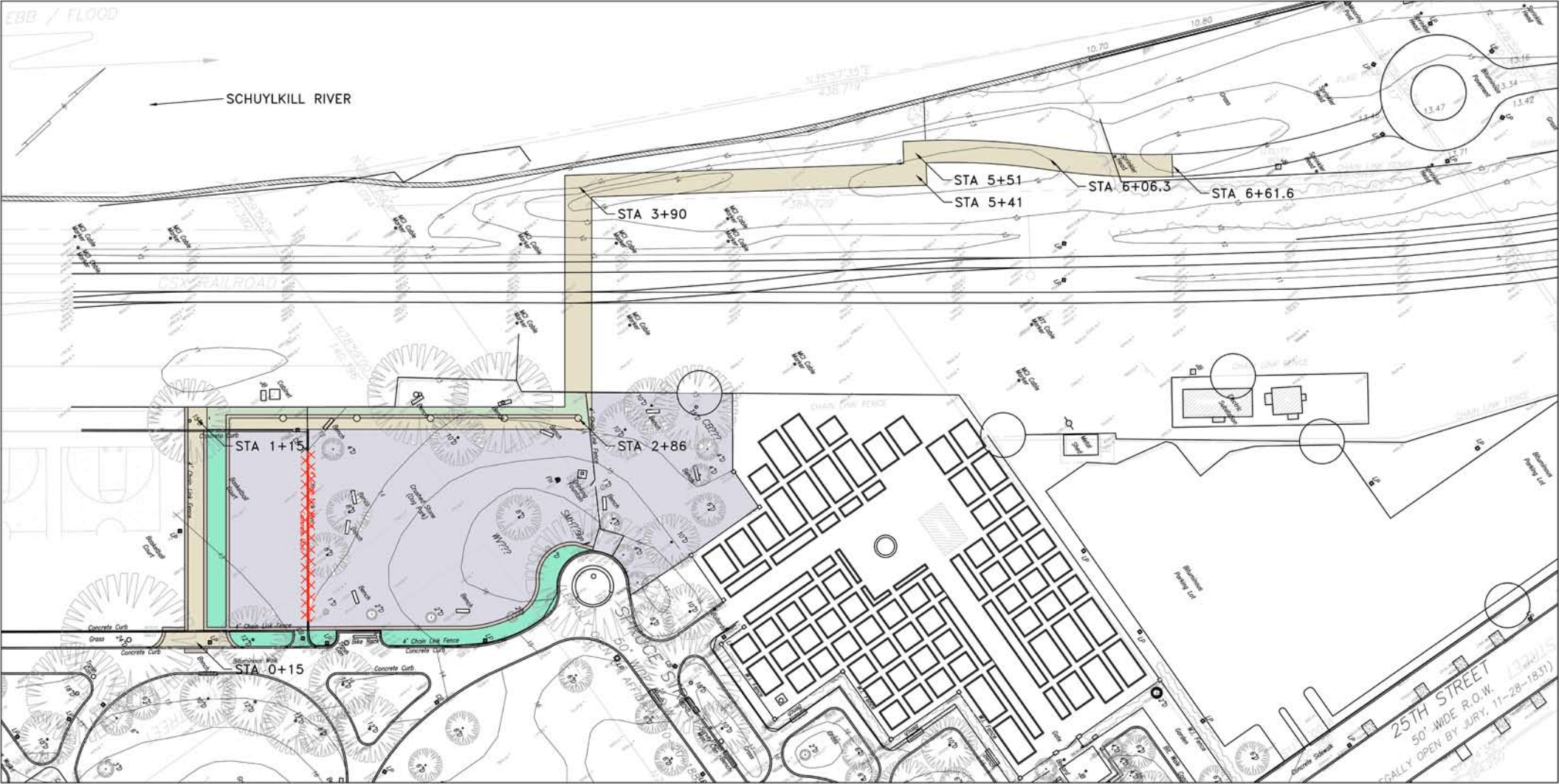
ALIGNMENT PLAN 20 SCALE